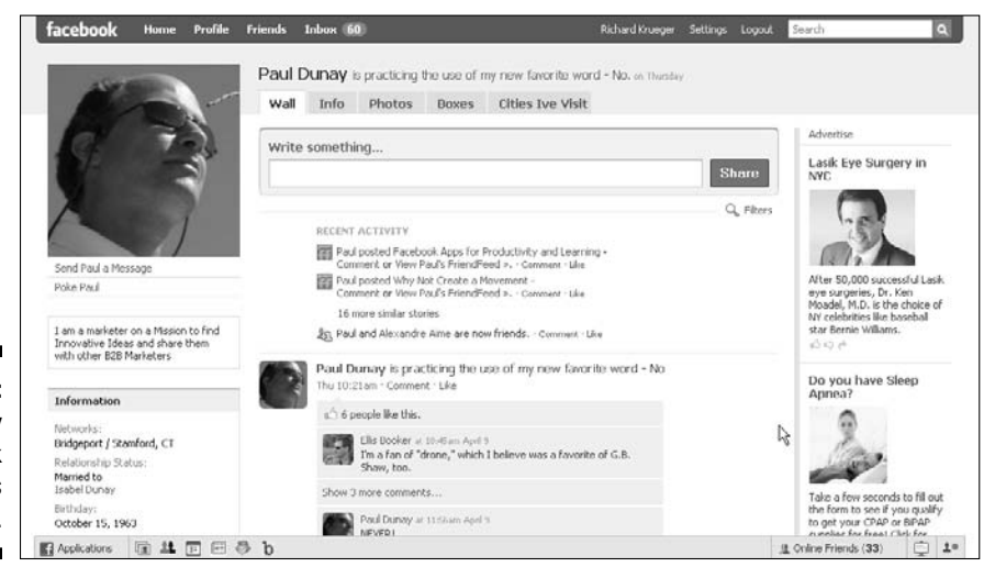
Figure 1-6: Every Facebook member has a profile.

Finally, Facebook Pages have no fan limit, and can automatically accept fan requests, whereas profiles are restricted to a 5,000-friend limit and friends must be approved.