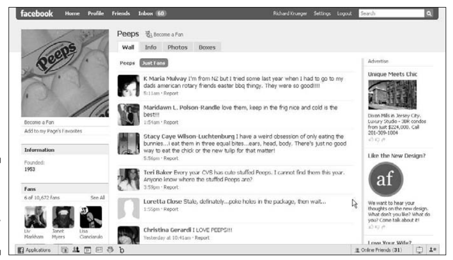
Figure 1-4: The Marshmallow Peeps Page.

The challenge is giving people a reason to participate. Whether it's sharing hilarious pictures of Peeps in compromising situations or debating the benefits of salt and bacon as an essential part of a diet, consumer-facing businesses are interacting with their customers in entirely new ways via Facebook.