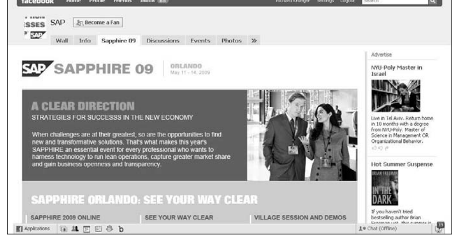
Figure 1-5: B2B companies use Facebook to build brand awareness.

And why are they on Facebook? Because that's where their customers are. For many B2B marketers (for example, see BearingPoint in Figure 1-5), Facebook is another touch point, a new channel from which to communicate directly with their customers, partners, and employees — past, present, and future.