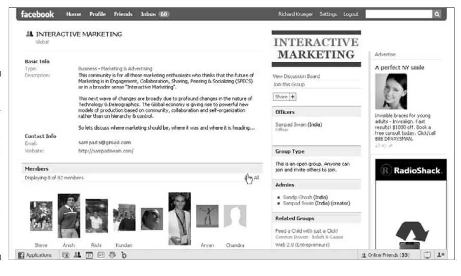
Figure 1-7: A Facebook Group provides members with an online hub to share opinions about a topic.

When an admin updates a Group page (see Figure 1-7), the News Feed story includes the name of the group's admin. Pages, however, attribute updates to the Page and never reveal the admin's name. Groups also don't offer the status update capability, which has recently been added to Pages.